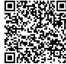
Figure 1: QR code for questions and feedback forms. office.com/r/pmvSz20i6p

For brevity, information in the report has been taken on background. To maintain transparency, items are further elaborated in this section. Please contact the me through the QR code (Fig 1) to anonymously request further information, email felix@ic.ac.uk directly, or ask in-person at Union Council on 8 th November 2022.