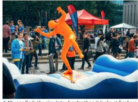
A 1<sup>st</sup> year finds the simulator harder than it looks at freshers fair

One of the risks for the club identified in the handover period last year was that with the Christmas trip being the largest contributing factor to member recruitment and the term dates being aligned in such a way as to force the club to have the Christmas trip in January, there was potential for a loss in members as many Imperial students have exams when term starts again and hence would be unwilling to come on trip. Historically whenever the trips have been in the New Year attendance has decreased from a pre-Christmas average of around 150 to approximately 80-90. Fortunately this scenario did not play out and 150 students decided to attend our headline event of