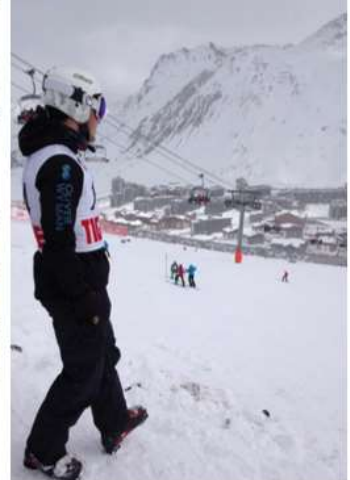
At the top of the race course overlooking Tignes