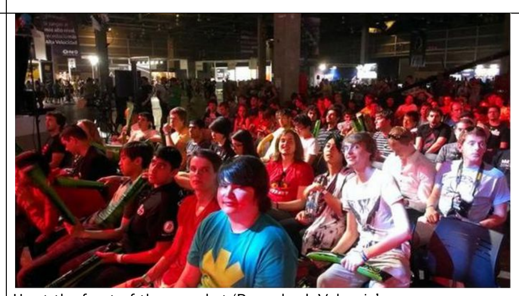
Us at the front of the crowd at 'Dreamhack Valencia'