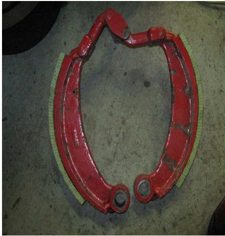
One of the newly lined brake shoes