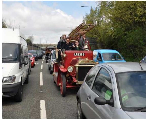
Jezebel in traffic on route to Brighton