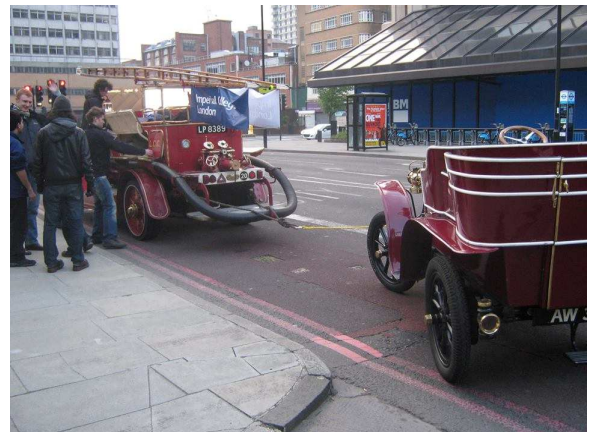
Jezebel giving Boanerges a tow home